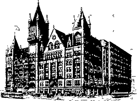
HEAD OFFICE, TORONTO, CANADA.