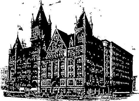
HEAD OFFICE. TORONTO, CANADA.