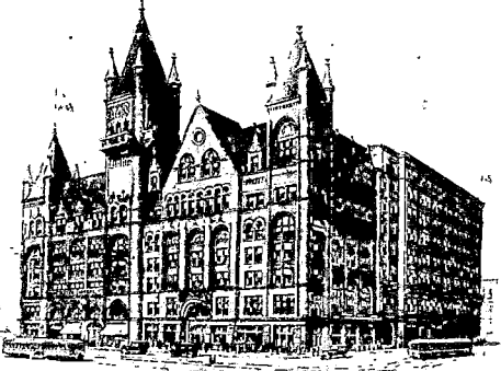
HEAD OFFICE, TORONTO, CANADA.