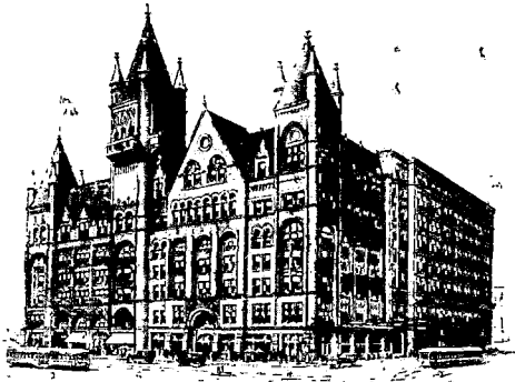
HEAD OFFICE, TORONTO, CANADA.