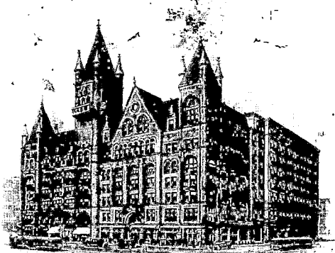
HEAD OFFICE, TORONTO, CANADA.